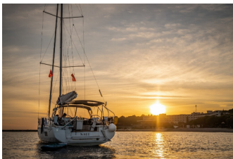
OCEANIS 46.1 - layout 4 CABINS & 2 HEADS